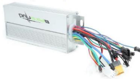
Figure 3. Controller.

3. Controller. The speed controller of an electrical bike is Associate in Nursing electronic circuit. This controller unit uses power from the battery pack and drives it to the motor. Differing types of controllers area unit used for brushed and brushless motors. For adaptive e-bikes, a conversion kit is employed and therefore the controller is that the main part of that kit. the electrical bike speed controller sends signals to the bike's motor in varied voltages. These signals sight the direction of a rotor relative to the starter coil. the correct perform of a speed management depends on the use of assorted mechanisms.