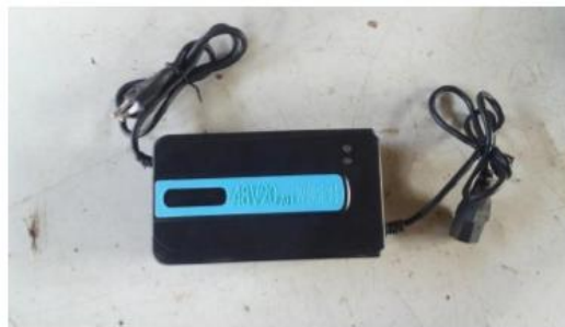
Figure 5. Wall Charger.

5. Battery charger. The battery charger is a device which is used to put energy into a rechargeable battery by forcing an electric current through it. This charger takes the electric current from the main supply and is connected to a charger plug of a controller which supplies the flow of current to the battery. This wall charger can charge the pack of 4 batteries connected in series in 5-7 hours.