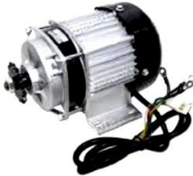
Figure 1. Motor.

1. Motor. There square measure totally different placements for an electrical bike motor, every has its own benefits; front hub, rear hub and mid-drive motor the most perform of the motor is to manage force. The additional advanced the electrical motor, the additional force it offers. The additional force you've got the additional power you'll get out of the bike.