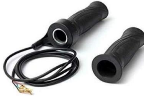
Figure 4. Throttle.

5. Battery charger. The battery charger is a device which is used to put energy into a rechargeable battery by forcing an electric current through it. This charger takes the electric current from the main supply and is connected to a charger plug of a controller which supplies the flow of current to the battery. This wall charger can charge the pack of 4 batteries connected in series in 5-7 hours.