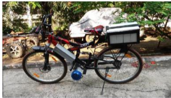
Figure 7. Electric Bicycle.

Here we have used brushless dc motor with 750watt power and 450rpm as rated and 540rpm as practically observed. The motor runs on 48volts and 15.6amps power source. As for the operating purpose, dc controller is required for the BLDC motor. And this whole needs a battery power source for running the motor. Therefore, here we have used 4 batteries (each of 12volts) connected in series to get the desired output of 48volts.