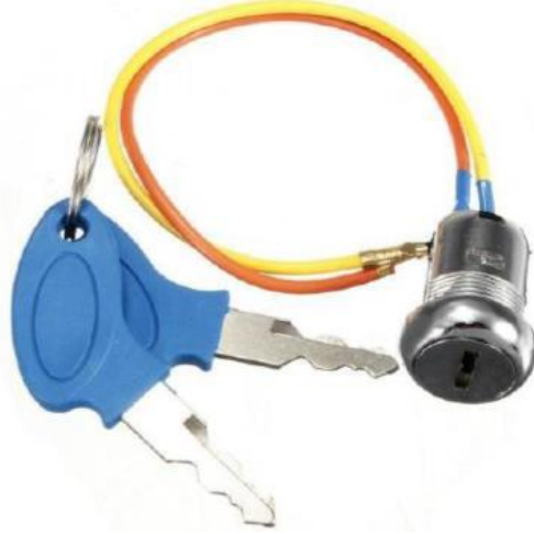
Figure 6. Key switch.