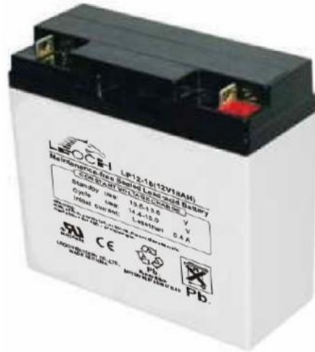
Figure 2. Battery.

3. Controller. The speed controller of an electrical bike is Associate in Nursing electronic circuit. This controller unit uses power from the battery pack and drives it to the motor. Differing types of controllers area unit used for brushed and brushless motors. For adaptive e-bikes, a conversion kit is employed and therefore the controller is that the main part of that kit. the electrical bike speed controller sends signals to the bike's motor in varied voltages. These signals sight the direction of a rotor relative to the starter coil. the correct perform of a speed management depends on the use of assorted mechanisms.