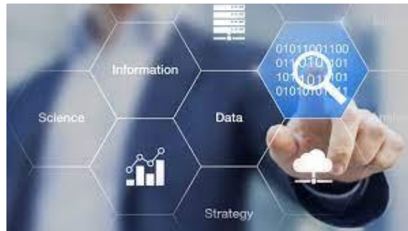
Figure c: Application of Data Mining in Financial analysis.

Uncovering of change launder and other fiscal crime.