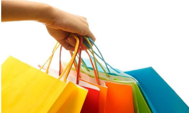
Figure d. Analyzing the customers buying pattern in Retail Industry.

The application discussed above tends to knob quite diminutive and standardized data sets for which the arithmetic technique are apposite. Huge quantity of data has been together from precise sphere such as geosciences, astronomy, etc. A bulky quantity of figures set is being generate because of the fast geometric simulation in different field such as average temperature and network model, chemical commerce, runny dynamics, etc. next are the application of data mining in the countryside of controlled application