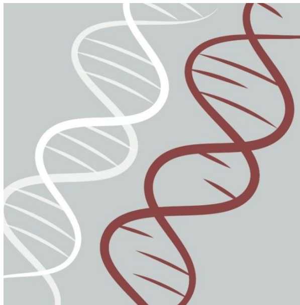
Figure a. Application of Data Mining in DNA Analysis.

Semantic integration of assorted, circulated genomic and proteomic database. Configuration, indexing, correspondence search and relative analysis numerous nucleotide sequence. Sighting of structural patterns and psychotherapy of heritable network and protein pathway. Relationship and alleyway study. Apparition tools in inherited data psychotherapy.