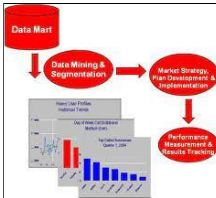
Figure e: Application of Data Mining In Telecom Industry.